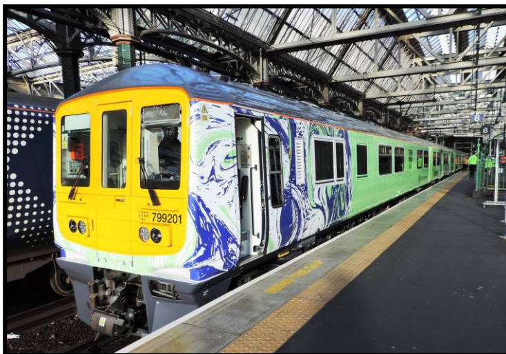
Hydroflex hydrogen/electric train (above) and VivaRail battery train in Glasgow Central.

A Hydroflex hydrogen/electric train (a Class319 electric multiple unit converted by train leasing company Porterbrook) gave demonstration runs round the Cathcart Circle during COP26. To allow hydrogen tanks and fuel cells to be viewed by delegates on the trip, the tanks were empty and the train used 25kV/AC power. The hydrogen tanks and fuel cells give a range of 600 miles on hydrogen. The tanks fully occupy one coach of the four-coach train, which could be a consideration on single-track lines where overall train length is limited by the length of passing loops.