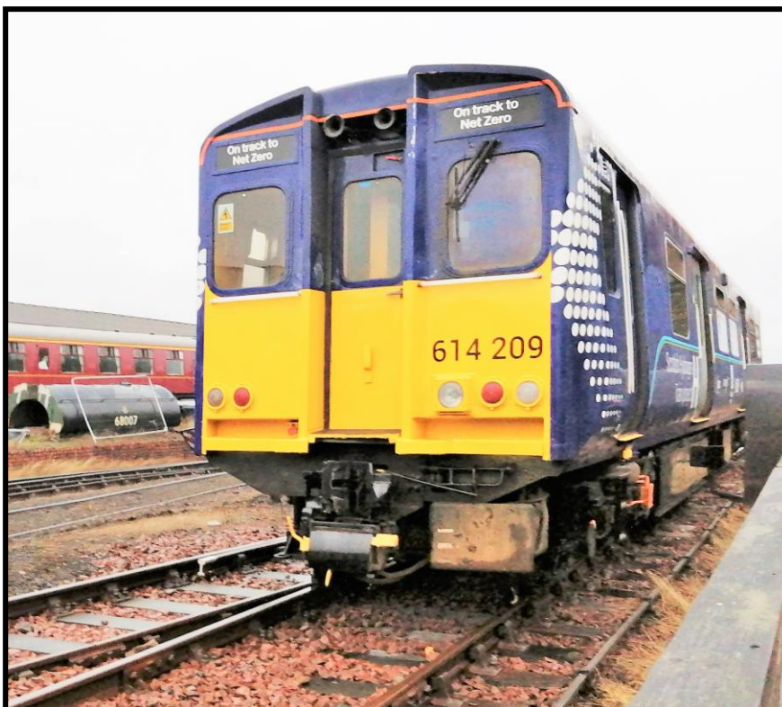
A Class 314 is being converted to hydrogen fuel cell power (reclassified Class 614) at the Bo'ness and Kinneil railway workshops by a consortium led by Arcola.

Hydrogen fuel-cell stacks have a sluggish response to demand for power level changes. Their efficiency depends on the operating condition. Powertrain control strategy may therefore involve fuel-cell operation with slow rates of change, with fast dynamic changes and peak loads being supplied by the battery pack.