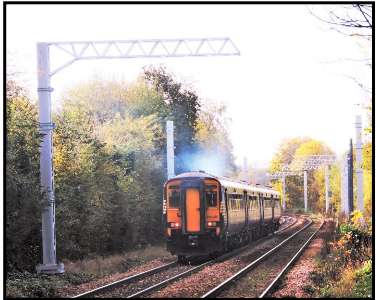
Transport Scotland has a rolling programme of electrification. Overhead gantries are already erected at Crossmyloof (above) on the electrification scheme to Barrhead and East Kilbride as a smoky 4-car Class 156 leaves for East Kilbride on 9/11/21.